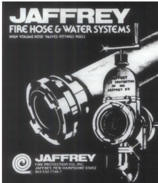
1966-1997 Jaffrey Fire Protection

Formerly known as Armored Textiles Inc. (ATI), Kuriyama Fire Products (KFP) manufactures high quality fire hose, nozzles and other fire suppression equipment, for the U.S. and European Municipal Fire Markets dating back to the 1950's, at their ISO 9001 facilities in Barcelona, Spain and Buenos Aires, Argentina. ATI was originally founded in 1966 as Jaffrey Fire Protection and was known for pioneering the use of larger diameter hose (LDH) and developing innovative water supply methodologies.