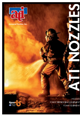
1997-2015 Armored Textiles