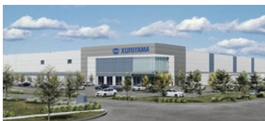
Central Distribution Center Huntley, IL

Kuriyama Fire Products also utilizes the vast Kuriyama of America Warehouse and Distribution Network, based out of Huntley, IL with additional warehousing in Reno, NV; Houston, TX; Cream Ridge, NJ and Acworth, GA; providing local inventory and fast delivery where and when you need it.