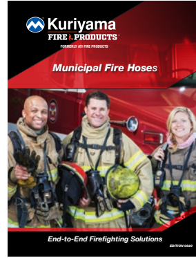
2015-current Kuriyama Fire Products