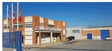
Manufacturing Facility Barcelona, Spain