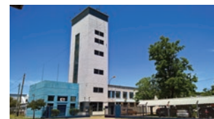
Manufacturing Facility Buenos Aires, Argentina